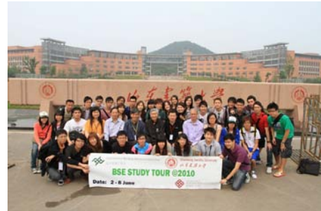
Group photo at the front gate