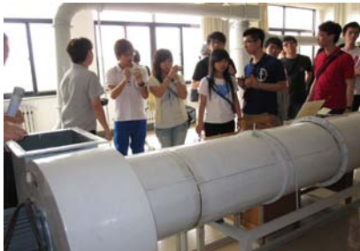
Laboratory tour at SJU