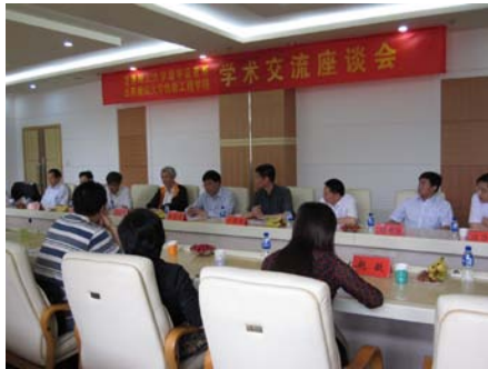
Open forum with President of SJU