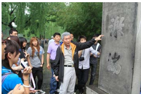
Explaining turbulence and strong turbulent flow