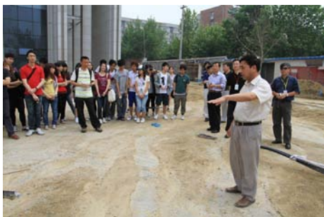
Site visit to Shandong Geological Museum

SJU had also arranged a technical site visit to the Shandong Geological Museum which had been newly installed with ground source heat pumps for central heating and cooling. A briefing on the design with basic analytical solutions of the thermal conduction equation was presented by Dean Diao Nai-ren and Prof. Chow at the site.