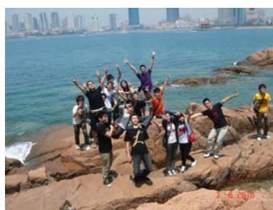
Reef of Qingdao

Thanks are due to the following students for their coordination and assistance: