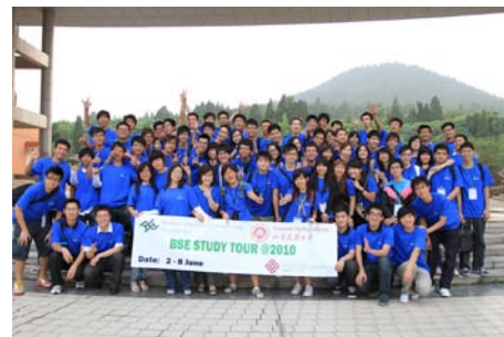
SJU and PolyU students