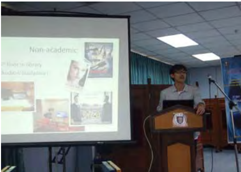
BSE Student's presentation