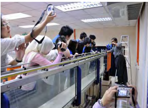
Lab visit: Density Jump