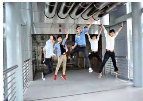
Jumping on the skybridge