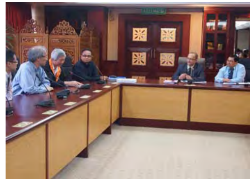
Meeting with UTHM staff