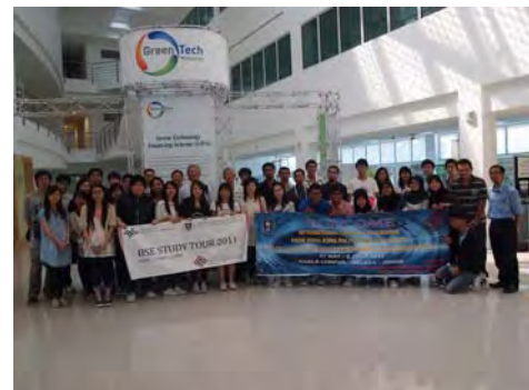
Zero Energy Building

After staying at Kuala Lumpur for a night, students visited the Zero Energy Building (Green Building) and toured around Putrajaya, the capital district where all ministry headquarters located, in the morning of 2 June 2011. PolyU-BSE students then said goodbye to UTHM staff and students. They accompanied BSE students and staff to the Kuala Lumpur International Airport.