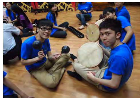
Games played by BSE students and UTHM students