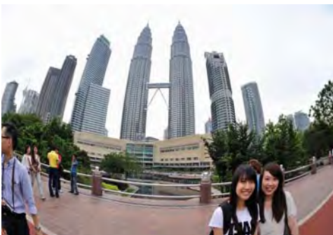
The PetronasTwin Tower

The whole group then visited the skybridge of the supertall building, Petronas Twin Tower. That tower was the tallest supertall building at one time, now overtaken by the Dubai Tower, Taipei 101 and the Shanghai WFC. BSE staff and students learnt the building service design of supertall buildings, particularly on safe egress. As reported by TV, it will take over 2 hours to evacuate the whole supertall building, and at least half an hour using elevator. The team also visited the auditorium located between the twin towers and learnt the acoustics design, particularly noise and vibration from the adjacent underground subway systems. Such acoustic design might be useful in controlling noise of BSE new offices in the PolyU phase 8 development with an underground railway workshop accessed to the MTR-East Rail.