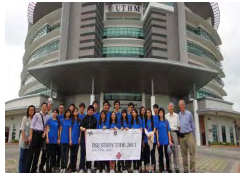
Group photo at UTHM

Students from both Universities presented topics on study life in Malaysia and Hong Kong respectively in the afternoon. PolyU-BSE students learnt not only on university life and building services installations in the rapidly developing country, but also Malaysian history and culture. A dinner, hosted by BSE to thank UTHM, was held at the Hotel Kathrina. BSE and UTHM staff and students were given more opportunities to understand each other better in this social gathering.