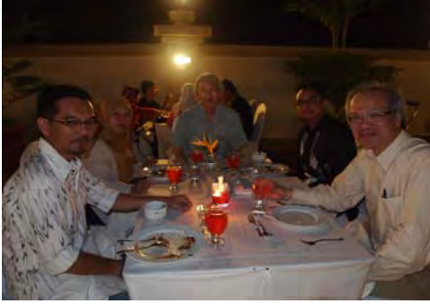
Dinner with UTHM staff