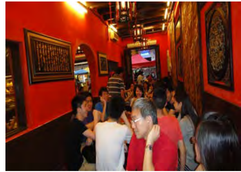
Southern Chicken Rice Ball Dinner