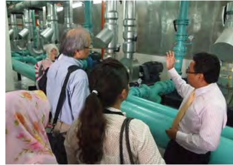
Site Visit of UTHM Library Plant Room

The Team left Batu Pahat on Wednesday, 1 June 2011, and visited with UTHM students in the Diamond Building at Putrajaya which was just opened by the Malaysian Deputy Prime Minister on 31 May 2011. Diamond Building is the headquarter of the Energy Commission with many new green features. All the building services installations were demonstrated and explained by the officer-in-charge. That was the first time they entertain overseas visitors.