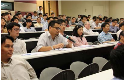
Hot questions from industry

Before closing, many attendees raised meaningful questions and there was a fruitful discussion among the participants.