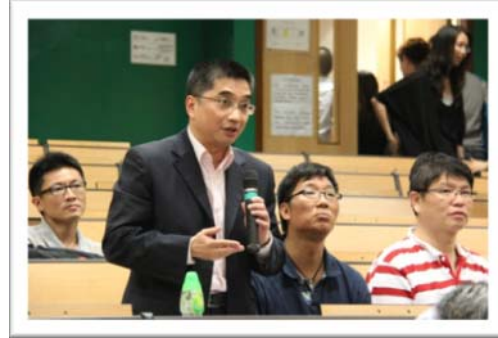
Audience members listening and participating in Q&A session

The seminar attracted a full-house audience eager to learn about intelligent buildings as sustainable systems.