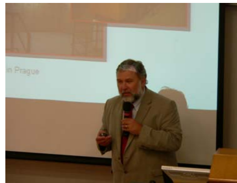
CPD lecture by Professor Kabele

Reduction of energy use in buildings is the objective that the European community has already set at the beginning of this millennium in the framework of Energy Performance of Buildings Directive (EPBD 91/2002). A Directive recast (2010/31/EU) was issued in 2010, modifying from the original EPBD from 2002 and defining new means of improving the energy performance of buildings – including building energy performance certification and the concept of “building with almost zero energy consumption”, which should be implemented on all new buildings latest in 2020.