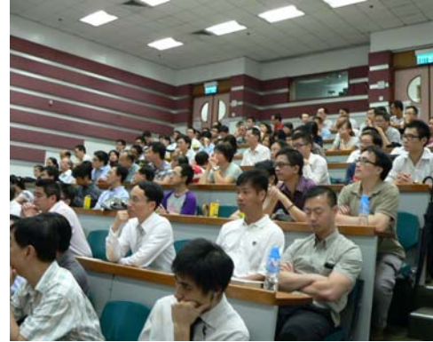
Participants of the CPD lecture

In the lecture, Professor Kabele gave an overview of the European approach to energy efficient buildings. The presentation outlined new requirements to the building materials, technologies and concepts related to nearly zero energy buildings. Impacts of these new requirements to the building industry were also discussed. The speaker also presented a number of examples on technologies and building concepts used in low energy houses in Central Europe.